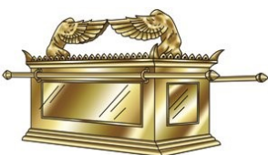
Ark of the Covenant

Now Bezalel made the ark of acacia wood; its length was two and a half cubits, and its width one and a half cubits, and its height one and a half cubits - Moses had the ark made (Dt. 10:3), but Bezalel did the skilled work. See comments on Exodus 25:10.